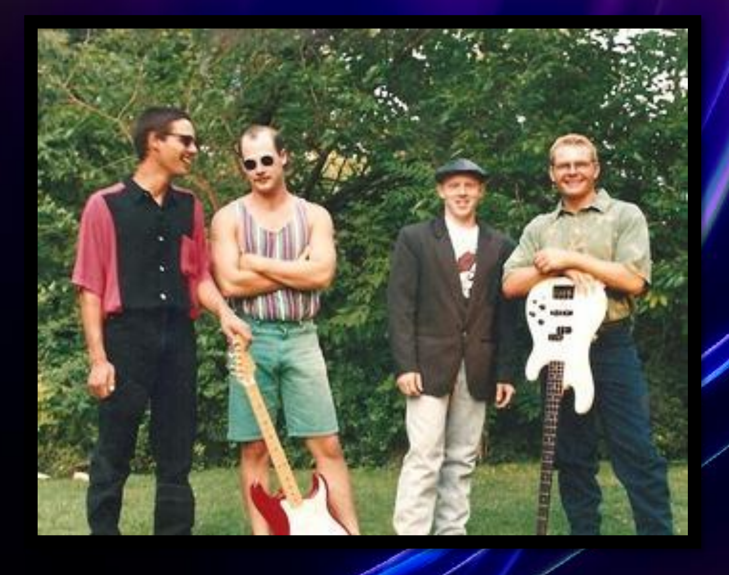
1994 KBS IBC Contest winners Rude Mood