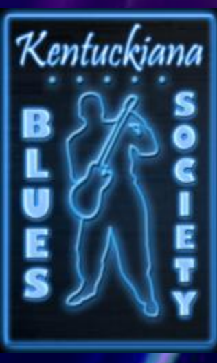
Stevie Ray's Blues Bar